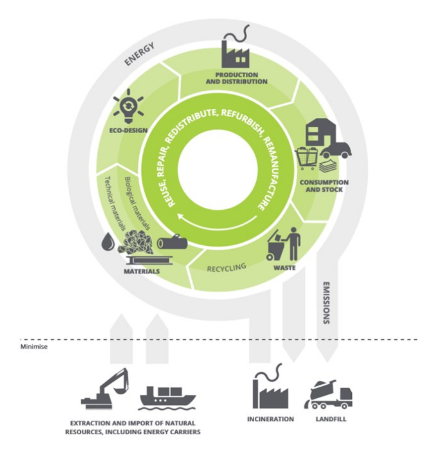
Image 18.1: A Simplified Model of the Circular Economy for Materials and Energy (European Environment Agency (EEA) 2016)

The principal objective of sustainable resource and waste management is to use resources more efficiently, where the value of products, material and resources is maintained in the economy for as long as possible such that the generation of waste is minimised. To achieve resource efficiency there is a need to move from a traditional linear economy to a circular economy (refer to Image 18.1).